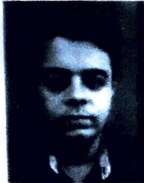
Licence holder sign